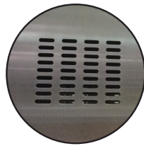
Vented Side Panels