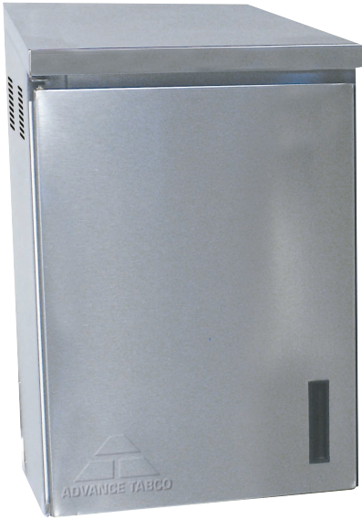
WCH-15-24 Left Hinged Shown (Standard)*